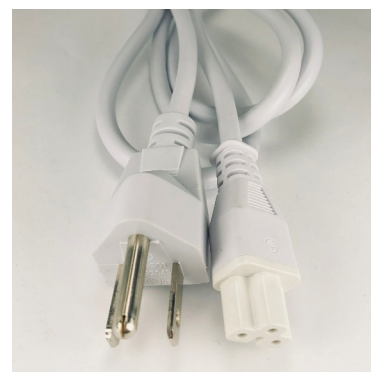
Optional: 2m Plug