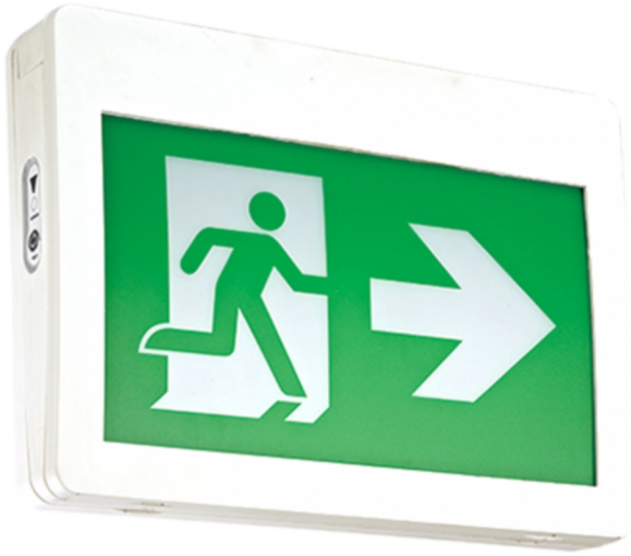
#989 - LED EX100-SP