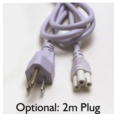
Optional: 2m Plug